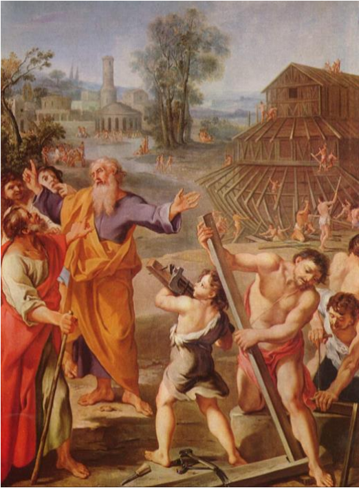
THE PATRIARCH NOAH

“And as in the days of Noah, so shall also the coming of the Son of man be. For as in the days before the flood, they were eating and drinking, marrying and giving in marriage, even till that day in which Noah entered into the ark, And they knew not till the flood came, and took them all away; so also shall the coming of the Son of man be.”