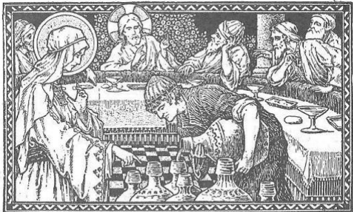
Jesus changes the water into wine at the marriage feast of Cana